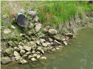
Flickr Creative Commons: citywalker