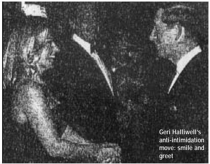
Geri Halliwell's anti-intimidation move: smile and greet